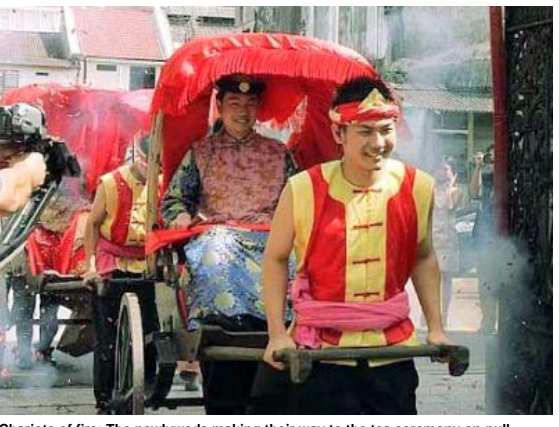
Chariots of fire: The newlyweds making their way to the tea ceremony on pull rickshaws.

"It was wonderful because my friends and family also got to witness a lovely culture," she said.