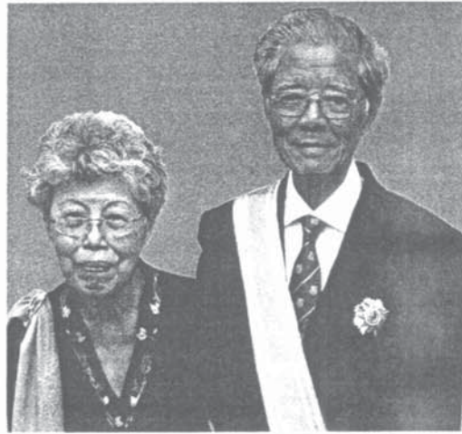
Clockwise from right. With VC